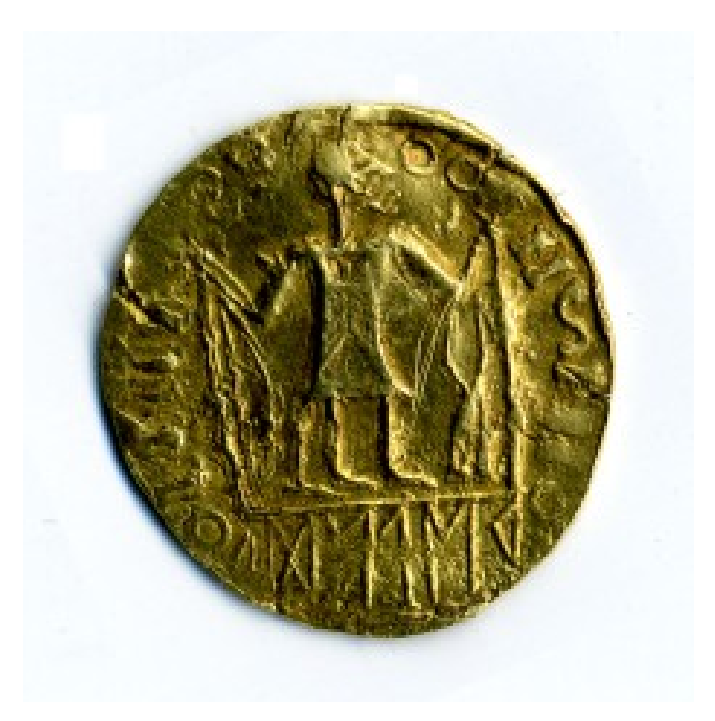
Fig. 4 Schweindorf solidus. The runes run from right to left WELAD.

Let us have a look at the corpus itself. There are some new views: the solidi from Harlingen and Schweindorf might be dated rather later than usually is assumed: in the 7<sup>th</sup> century. Moreover, the Schweindorf legend clearly represents 5 runes instead of 6: WELAD and no final rune U such as repeatedly has been put forward by several authors (Looijenga 2003:431). All solidi may be regarded "either English or Frisian, although England has a numismatic context for coins, which lacks in Frisia at this date. In fact SKAN- (in SKANOMODU) is probably the clearest piece of evidence for the 'Frisianness' of this group of coins, if it is a group and if they are coins" concluded Ray Page in 1996:141 after a long overview of the coins and their legends.