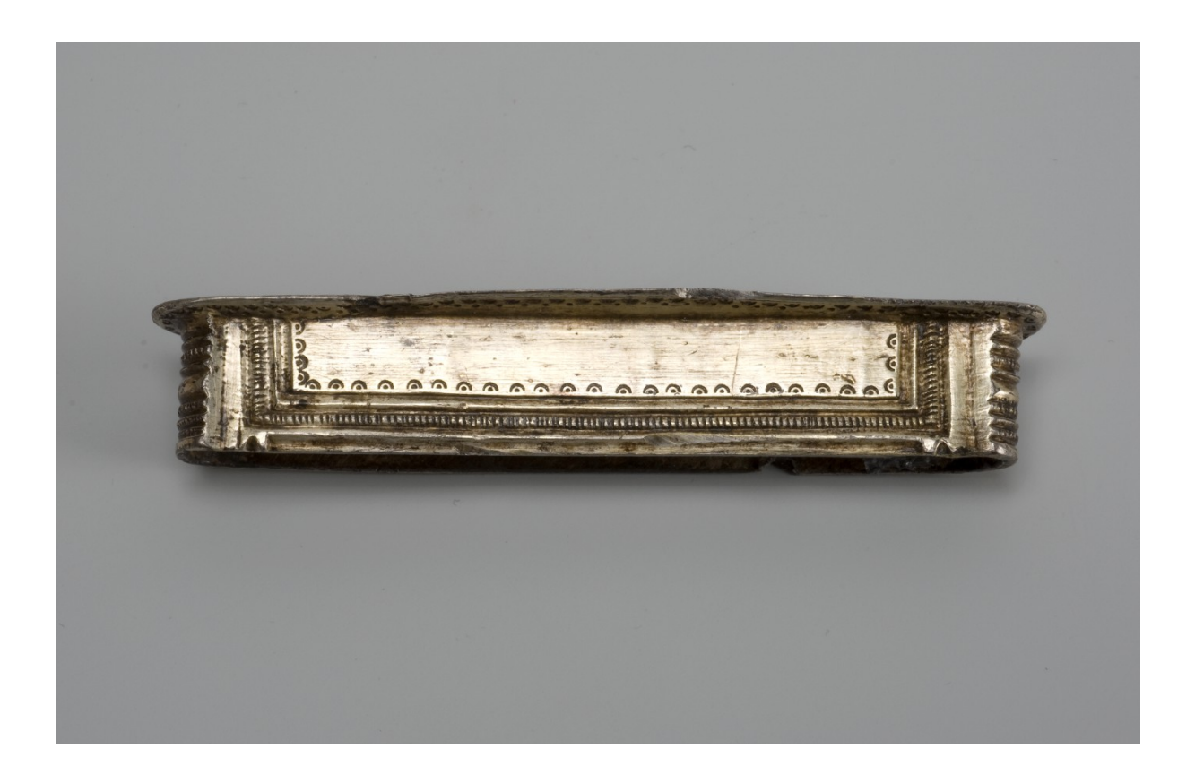
Fig. 2 The Bergakker scabbard mount, front.

und Bergakker and by myself (Looijenga 2003:317-322).