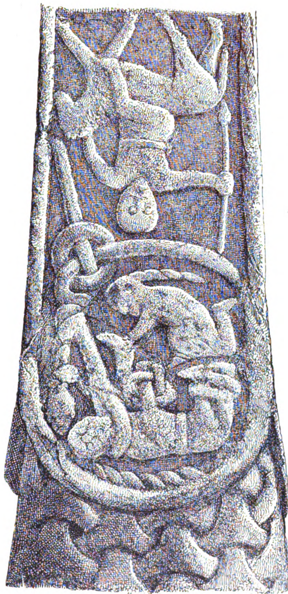
SIGYN CATCHING THE POISON. GOSFORTH CROSS, CUMBERLAND. 7th Century A. D.

But in another English 7th century slab we see SIGYN with her Cup. This is on the famous Gosforth Cross, a slab, 14 feet high, which has escaped the perils of some 1200 years by its position. It stands in a far off lonely little-visited