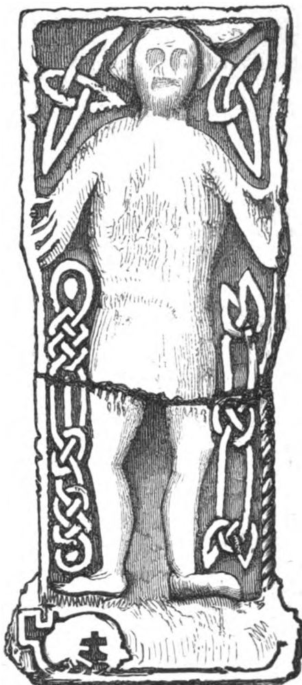
THE BOUND LÓKÉ. 7th century A. D.