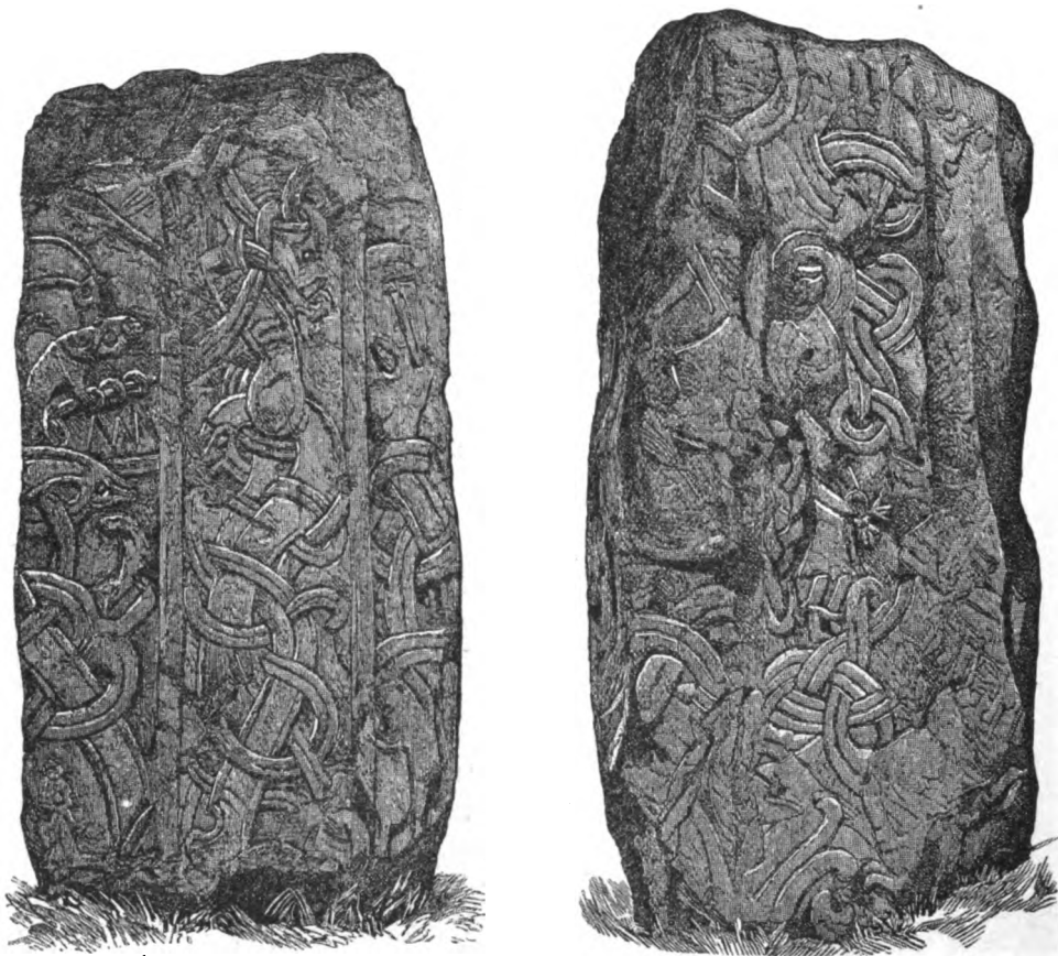
ILE OF MAN. 11th Century A. D.

SIGYN is distinguisht by her long hair. The Serpent is visible but indistinct, as the stone has suffered at that spot.