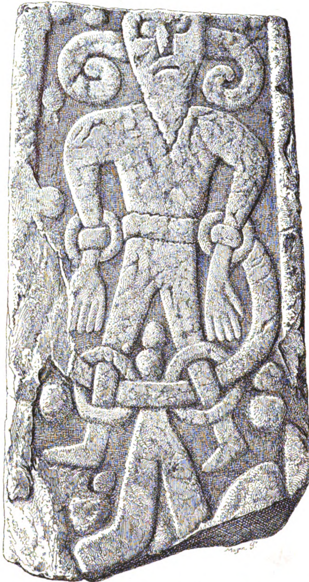
LÓKÉ BOUND. GOSFORTH CROSS, CUMBERLAND. 7th Century A. D.

I add, from the same English work *), p. 147 (21), the 7th century English slab where we see LÓKÉ punisht by the great Gods. He is bound hand and foot on a sharp cliff. But we cannot see his wife, catching the poison with her cup,