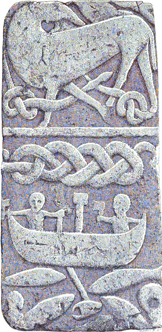
LÓKÉ BOUND. GOSFORTH CROSS, CUMBERLAND. 7th Century A. D.

punisht the giant-fiend who had caused the death of Baldor, so THUR was their strongest God, but he could not slay the Midgarth-Worm. He lifted his Hammer